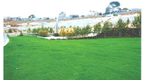
Restoration of Meadow at Summit 800

To the north-east of the MET, at the Minnie & Love Ward Recreation Center, a $7 million renovation of the multi-acre athletic field is partially completed. New stairs at both ends on Lobos St. have been added along with new fencing and lighting. The artificial turf has been installed at the east end, with the west end just near completion. The work is scheduled to be completed by September and open to the public soon after.