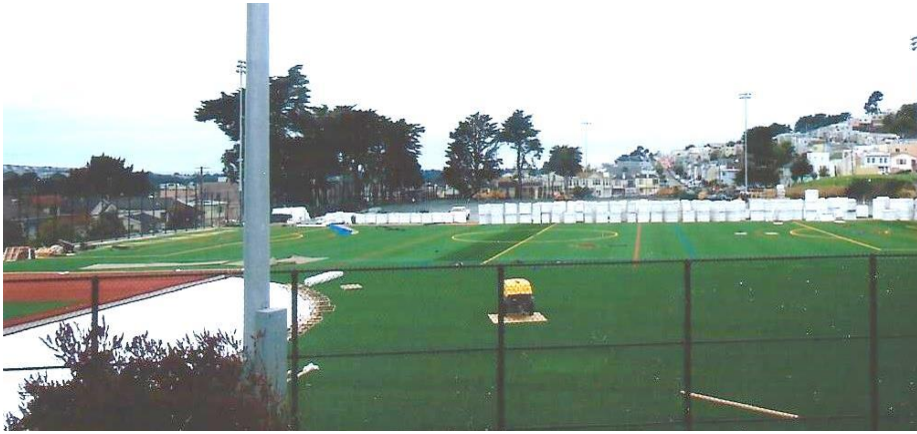
Ward Recreation Athletic Field