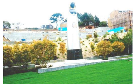
Peace Statue at Summit 800