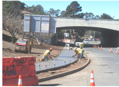
New Brotherhood Way sidewalk

Moving forward community leaders will work collectively to create a community Resilience Action Plan, establish an infrastructure to guide its implementation, evaluate the RAP on an annual basis, and update various dimensions of the program as needed.