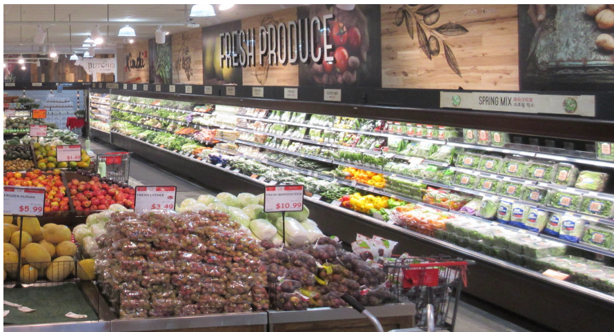
Produce section at H Mart

Store hours at Hmart remain 8:00am to 9:00pm daily.