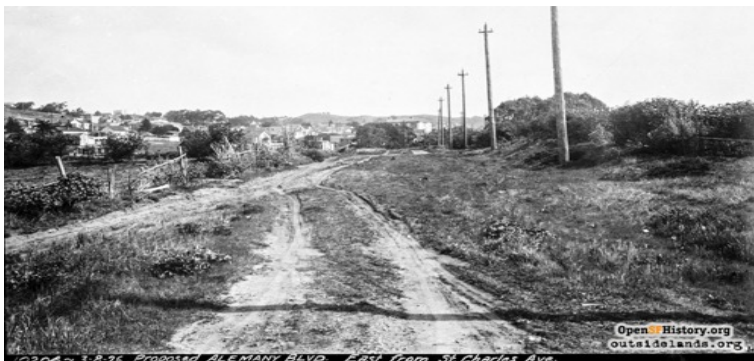
Proposed Alemany Blvd. looking east from St. Charles Ave., March 8, 1926.

Happy Holidays to all, as we look forward to the changes that lie ahead. See page 3 for the Leonard & Holt advertisement